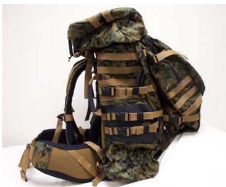
ILBE Pack System (Fig. 1)