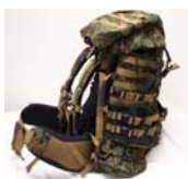
Main Pack (rucksack)